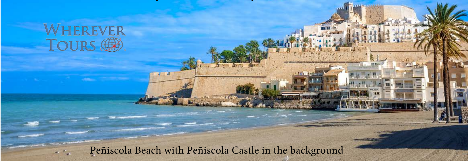
Peñíscola Beach with Peñíscola Castle in the background

BARCELONA · CAVA · PEÑÍSCOLA · VALENCIA · GRANADA SEVILLE · LISBON · FATIMA (Optional: CASCAIS, SINTRA)