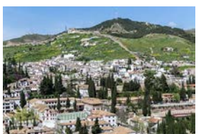
Albaicin District - Granada

Today's drive takes you from Valencia to Granada. The highlight of your sightseeing is visiting the 13th-century Alhambra, one of Spain's most celebrated monuments. This imposing hilltop fortress, declared a UNESCO World Heritage Site, is one of the finest examples of Moorish art and architecture. Walk along the lanes of the fragrant Generalife Gardens, which have beautifully designed courtyards, waterfalls, ponds, and views of the Sierra Nevada Mountains. Tonight, dinner with wine is included.