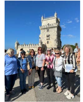
Belem Tower, Lisbon

Optional Experience: The tour leader will offer you an optional excursion to experience Cascais and Queluz Palace. Cascais, once a holiday destination for the Portuguese royal family and the world's monarchies, later became a regular meeting place for spies. Then proceed to Sintra to visit the magnificent Palace of Queluz. Pricing details will be provided prior to the tour. Advanced reservations will be required