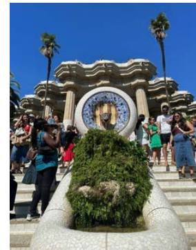
Gaudi's Park Guell

Today, begin with a drive along the Old Harbor to Plaza Catalunya, the city's bustling central square. Pass the famous works of Antoni Gaudi, the master architect, including the Casa Batlló, which seems to have been constructed from skulls and bones. Continue to visit the colossal Sagrada Familia, designed by Gaudi and the most iconic symbol of Barcelona. Afterward, visit Park Guell, another of Gaudi's many masterpieces, and finally, Montjuic Hill, the site of the 1992 Summer Olympics. Tonight, enjoy a special dinner with wine!