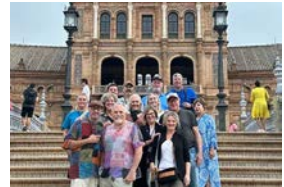
Welcome to Barcelona

Welcome to Barcelona! When you arrive, a Wherever Tours representative will greet you at the airport. You will then board a luxury coach and be transferred to your hotel. Most flights arrive early, and your room may need more preparation time. In such a case, you can leave your luggage with the concierge, and your tour leader will suggest how to begin exploring the city on your own. Your tour will start at 6 PM that evening, with an orientation meeting and a lovely party complete with dinner and wine!